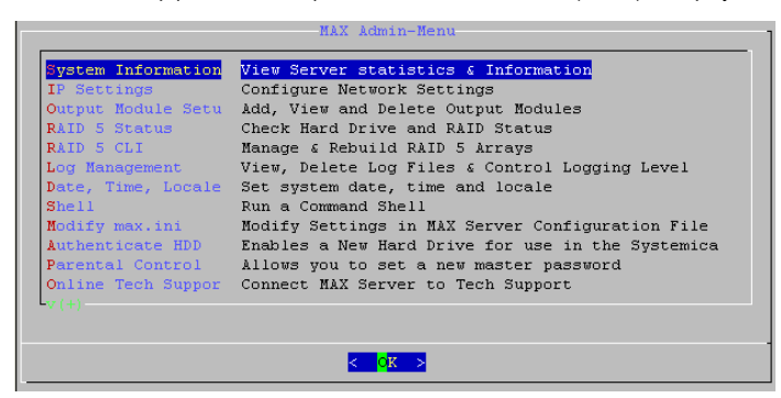
FIG. 3 MAX Admin Menu

Once the boot-up process is complete, the MAX Admin Menu (FIG. 3) is displayed: